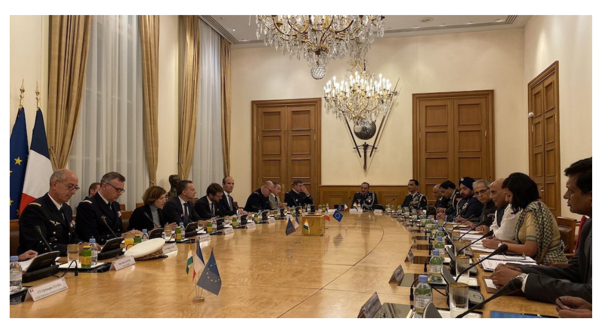
Gahlot also interpreted during meetings between the Indian Defense Minister and French Defense Minister Florence Parly during the second edition of the "India-France Annual Defence Dialogue."